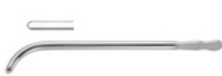
JI-118-101 Van Buren Urethral Sound