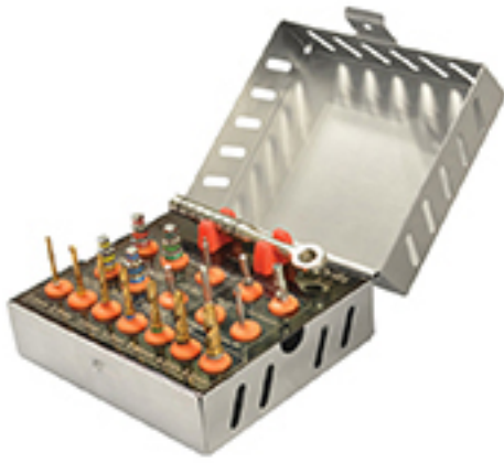
J-FDIK-401 BONE IMPACT KIT