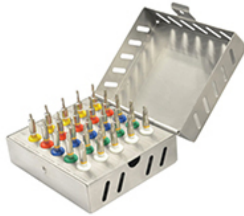
J-FDIK-402 CONICAL DRILL KIT