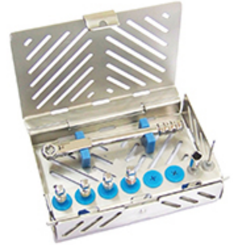
JFDIK-103 BONE COMPRESSIONKIT