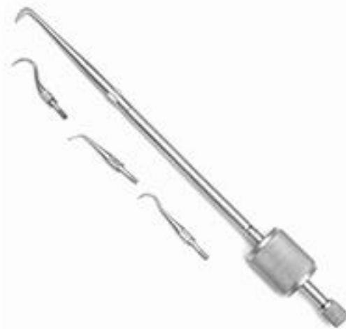
JFDIK-305 MORRELL CROWN REMOVER