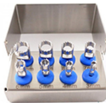
J-FDIK-408 TREPINE DRILLS KIT