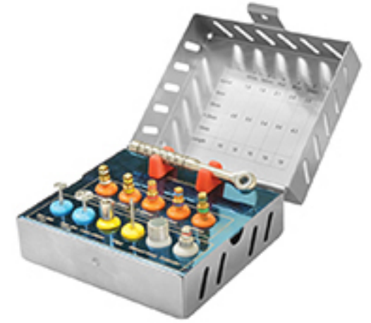
JFDIK-203 BONE EXPANDER KIT