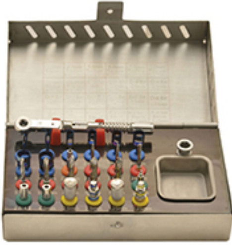
JI-DIK-4010 UNIVERSAL KIT 25 PCS