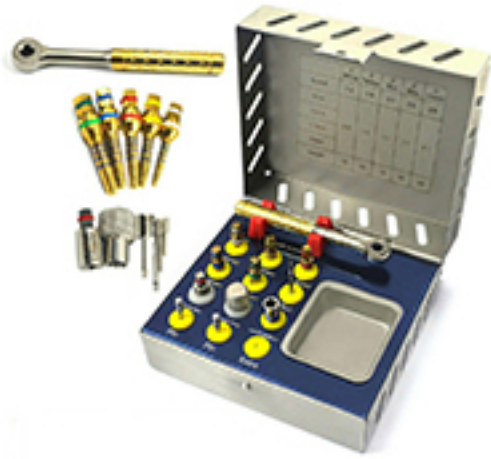
JFDIK-101 BONE COMPRESSIONKIT