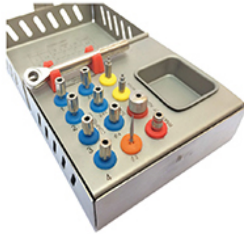
JFDIK-102 BONE COMPRESSIONKIT