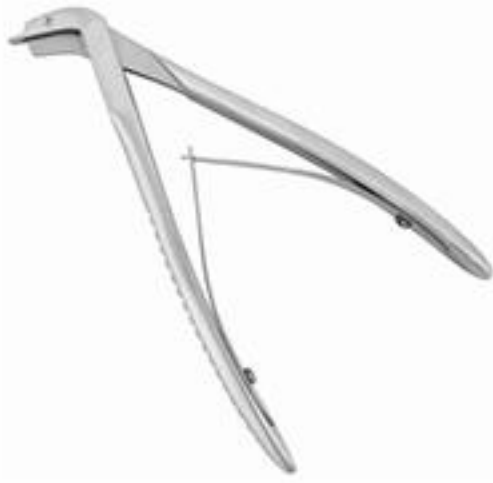
JFDIK-301 3-PRONG CROWN SPREADER