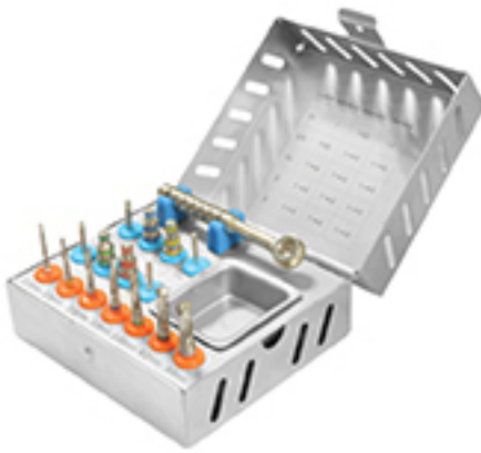
J-FDIK-404 DRILL KIT