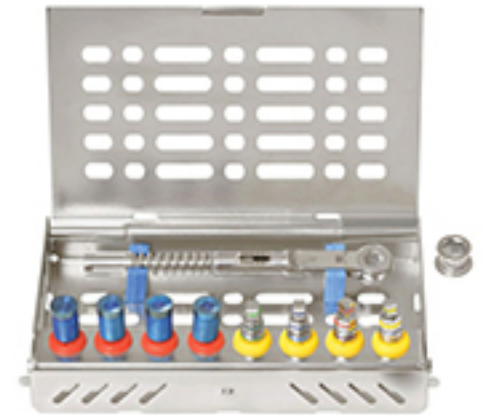
J-FDIK-406 MULTI MINI DRIVER KIT