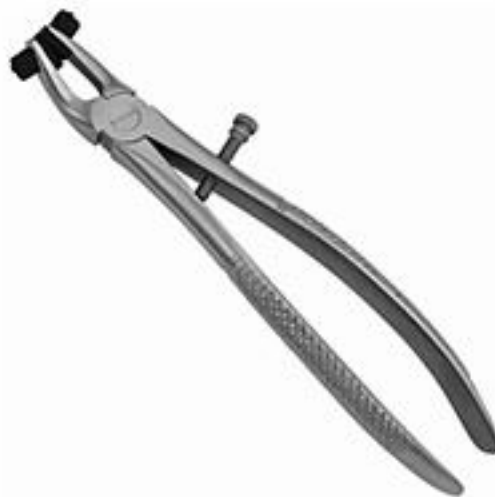
JFDIK-308 TRIAL CROWN REMOVING FORCEPS