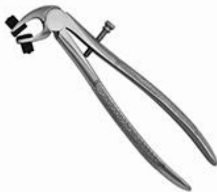
JFDIK-307 TRIAL CROWN REMOVING FORCEPS