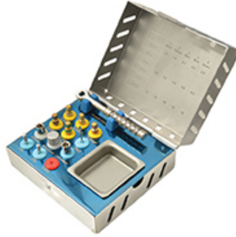
JFDIK-202 BONE EXPANDER KIT