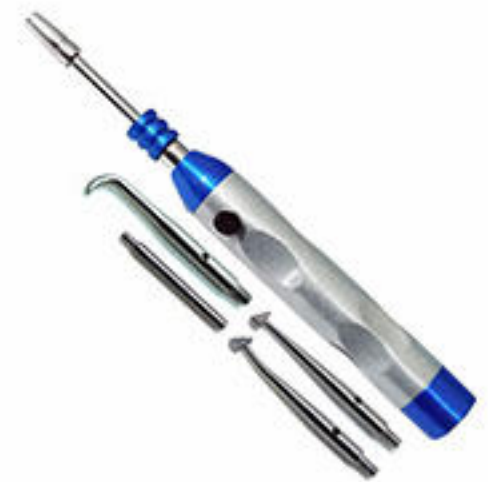
JFDIK-306 NEW DENTAL AUTOMATIC CROWN REMOVER