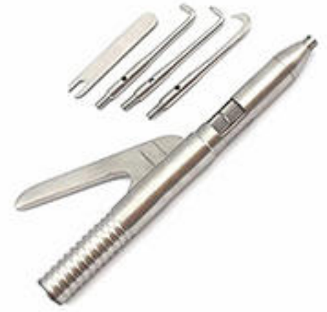
JFDIK-303 CROWN REMOVER GUN TYPE A CLASS