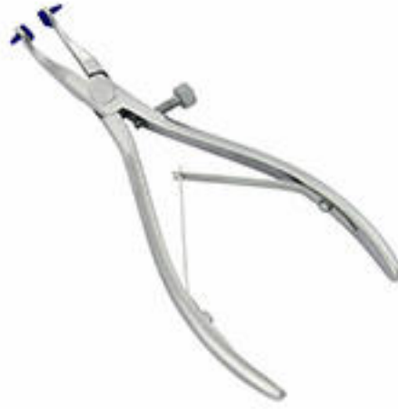
JFDIK-302 CROWN AND BRIDGE REMOVING PLIERS