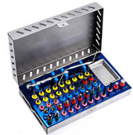
J-FDIK-409 UNIVERSAL DENTAL IMPLANT KIT 50 PCS