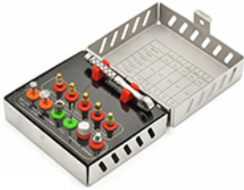
JFDIK-201 BONE EXPANDER KIT