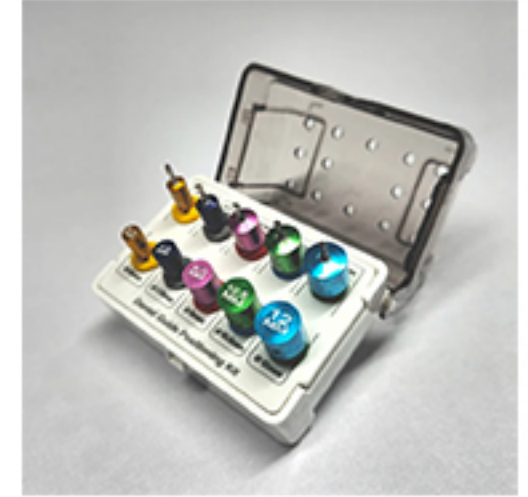
J-FDIK-403 DENTAL IMPLANT KIT