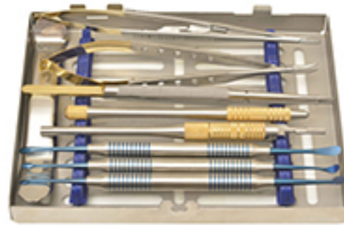
J-FDIK-405 MICRO SURGICAL KIT SET OF 9 PCS WITH CASSETTE