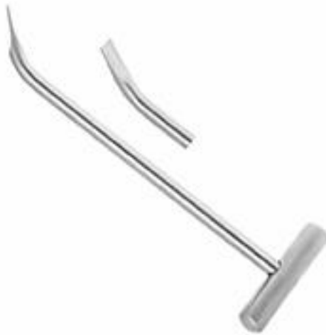
JFDIK-304 GOLDSTEIN CROWN REMOVER